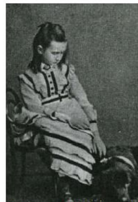
Francesca Cabrini at age 10

At thirteen, Francesca attended a school run by the Daughters of the Sacred Heart. Five years later she graduated cum laude, with a teaching certificate. After the deaths of her parents in 1870, she applied for admission to the religious congregation of the Daughters of the Sacred Heart at Arluno. These sisters told her she was too frail for their life – instead she became the headmistress of the House of Providence orphanage in Codogno, where she taught, and drew a small community of women to live a religious way of life. Cabrini took religious vows in 1877 and added Xavier to her name to honor the Jesuit saint, Francis Xavier, the patron saint of missionary service. Since her early childhood in Italy, Frances had wanted to be a missionary in China or India but Pope Leo XIII asked her to go west to the United States and work with the